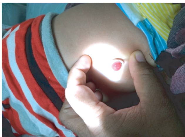
Figure-2: pre-operative picture showing adenoma arises from umbilicus.

An 8 months old male baby presented with umbilical discharge and a swelling on the umbilicus since the separation of the umbilical cord. He was born at home at term. Mother's antenatal period was uneventful but not monitored sonographically. The base of the umbilical cord was slightly swollen and separated on the 4 th day. After separation of the cord, parents noticed a yellowish discharge from the umbilicus. The discharge was foul-smelling and small in amount. Occasionally, clear, watery fluids came out through the umbilicus when the baby cried excessively. The patient passed urine and stools normally. The baby was seen by local physicians but the discharge did not stop. A few days later, they noticed a small pinkish mass on the umbilicus along with discharge. The mass was enlarging gradually. Chemical cauterization of the mass was done by a local physician. Following cauterization, the mass was reduced initially but, later on, recurred in its enlarged size. On examination, the umbilicus was inverted. A pinkish mass arising from the umbilicus, measuring about 1.25x1 cm in size, the surface smooth with slight discharge and peri-umbilical excoriation. Other abdominal findings revealed that everything was normal (Figure-2).